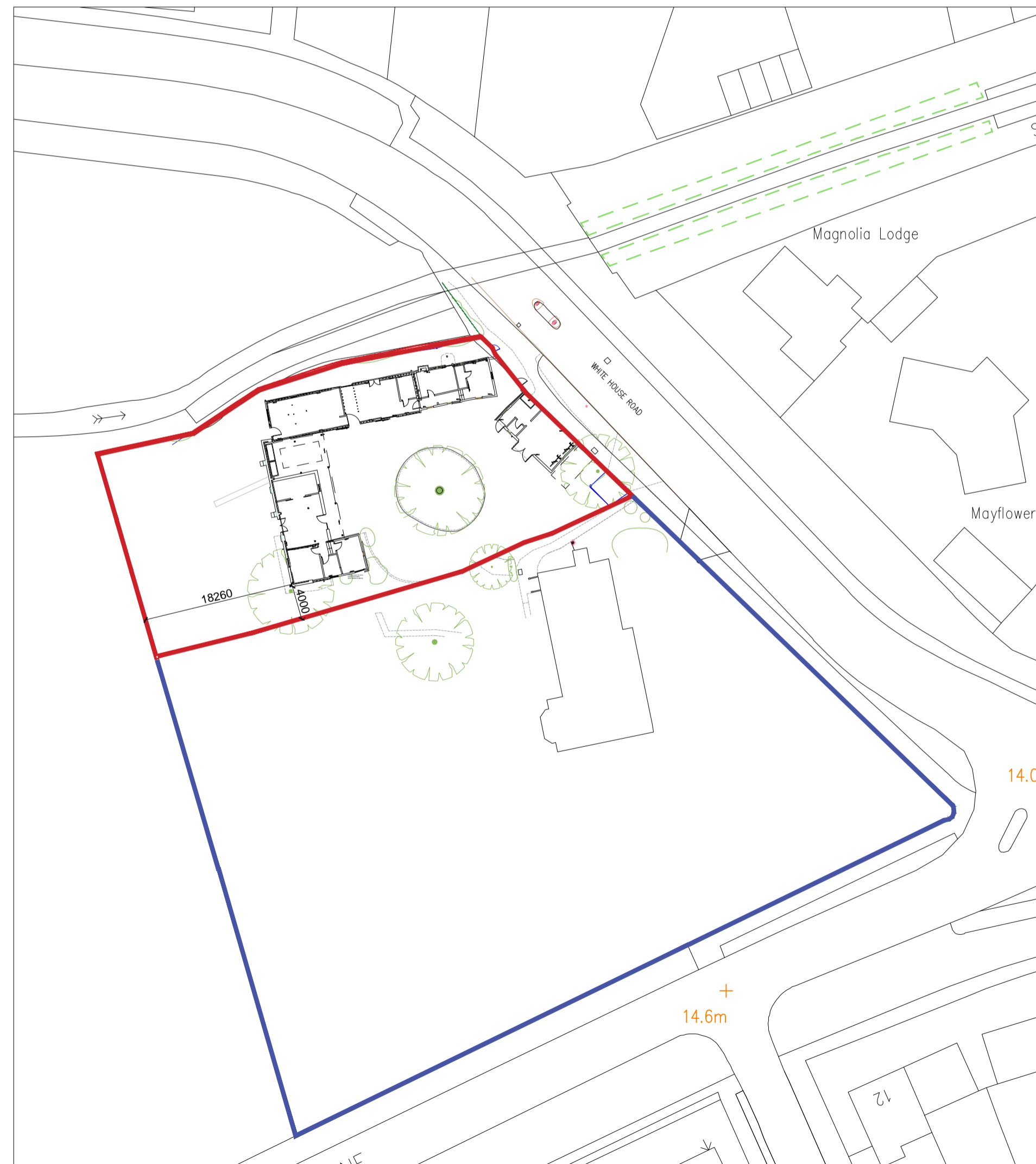
Proposed Block Plan 1:500